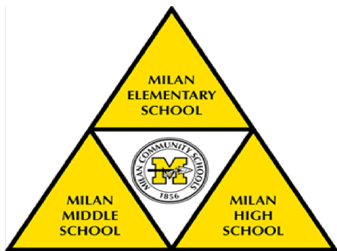
Triad of Excellence